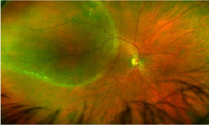
optomap ® (200°)

The Optomap allows us to capture an unprecedented 200 degree view of the retina! Compare it below to the view Dilation provides.